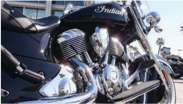
Indian Chief Classic