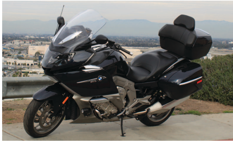
BMW K1600 GTL

new lineup of classically inspired and modernly equipped motorcycles. MotoQuest is one of the only rental businesses in the country that offers new 2014 Indian motorcycles for rentals, so if you want to thunder down the highway on one of the new Indian Chief or Chieftain motorcycles, this is your chance!