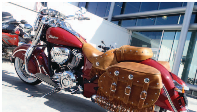
Indian Chief Vintage